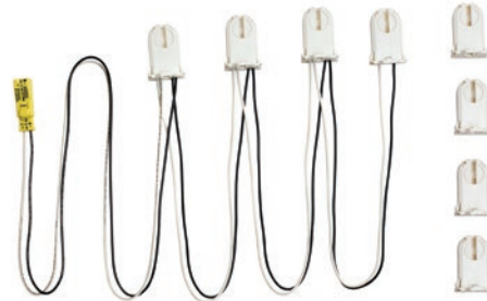
Part Number: 14084