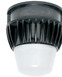
Part Number: 15973