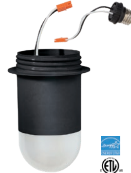
Part Number: 15980