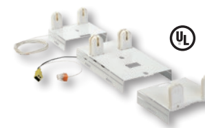
Pre-Wired 8-Foot Kit for four (4) Double-End Powered T8 LED Lamps Part Number: 18073