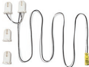
Part Number: 14087