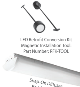
LED Retrofit Conversion Kit Magnetic Installation Tool: Part Number: RFK-TOOL