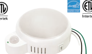
Part Number: 16545