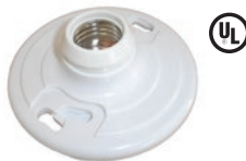
Part Number: 16510