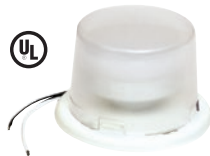
Part Number: 16531