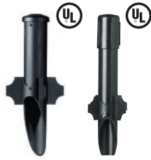
Landscape LightPost: Part Number: LLPN25B