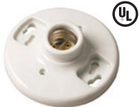
Part Number: 16500