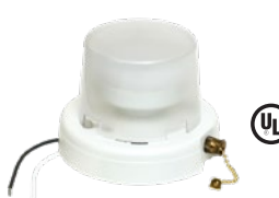
Part Number: 16536