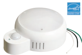
Part Number: 16540