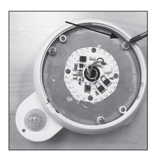
Figure 2B: Remove the Screws that hold the Mounting Base Plate to the Luminaire