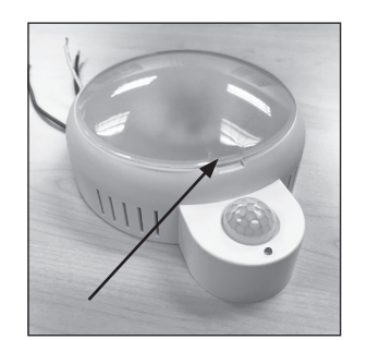
Figure 1A: Removing the Frosted Lens Diffuser from the Luminaire

1. This installation requires the luminaire's mounting base plate be connected directly to the junction box (See Figure 1A). To separate the mounting base plate, place a flat blade tool at an angle under the center of the Frosted Lens Diffuser (next to the Occupancy Sensor), then rotate the flat blade counterclockwise to remove the Frosted Lens Diffuser. Set the Frosted Lens Diffuser aside.