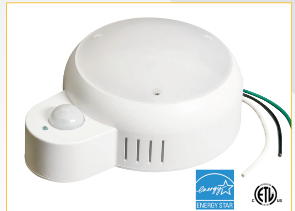
MOTION SENSING LED CLOSET LUMINAIRE

Specifications subject to change without prior notice.