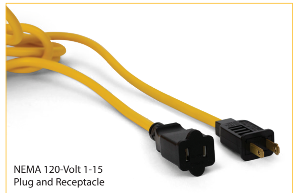
NEMA 120-Volt 1-15 Plug and Receptacle