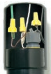
Landscape SplicePost Cap Cut-Away