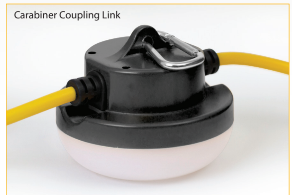
Carabiner Coupling Link