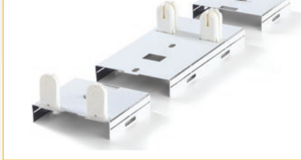
P/N 14070 and 18070: 8-FT Fixture Bracket Kit - Standard