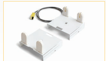
4-FT T8 LED LAMP RETROFIT KIT