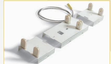
8-FT T8 LED LAMP RETROFIT KIT

For warranty information visit www.engproducts.com .