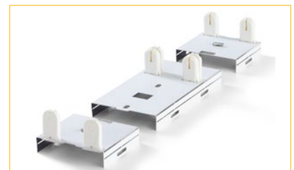
8-FT T8 LED LAMP RETROFIT KIT