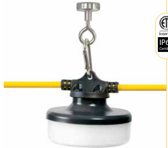
LED CordLights (Standard Lumen Output) Shown with Magnetic Suspension Hanger Part Numbers: 16140 and 16145; Magnetic Suspension Hanger: CORDLIGHT-MH