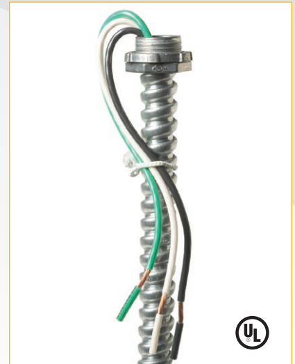
STANDARD HEALTH CARE FIXTURE WHIP Shown with Standard Screw-In Lock Nut Connector