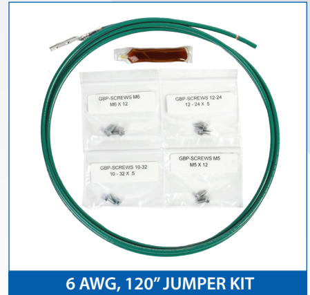
6 AWG, 120" JUMPER KIT

Engineered Products Company's (EPCO) Pre-Fabricated Ground Bonding Jumper Kits are one of the most critical elements in a safety grounded system to provide a positive and effective connection to ensure a low-impedance ground-fault current path to safeguard personnel and property from electrical shock hazards. EPCO Ground Bonding Jumpers ensure the equipment ground is at the same potential as the earth.