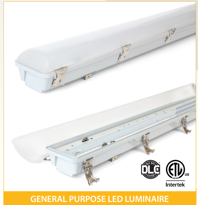
GENERAL PURPOSE LED LUMINAIRE