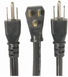
Power/Appliance Replacement Cords

Meets the requirements of the 2020 National Electrical Code: Articles 422.16(B)(1) and (2).