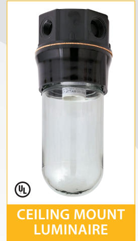
CEILING MOUNT LUMINAIRE

Note: Meets the requirements of the Minnesota State Board of Electricity Electrical Wiring requirements for Agricultural Buildings.