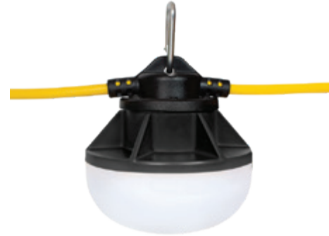
LED CordLights (High Lumen Output, 2,000 Lumens per Module) Part Number: 16050