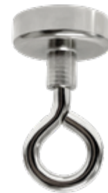
Magnetic Suspension Hangers for LED CordLight Maximum holding force - 22 lbs. Part Number: CORDLIGHT-MH