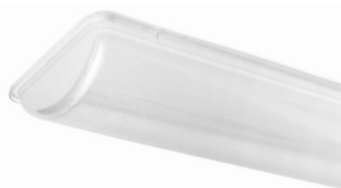
Frosted Smooth Diffuser (Optional Accessory) Note: Will not fit ALP Style Fixture Housings