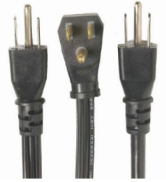
Power/Appliance Replacement Cords