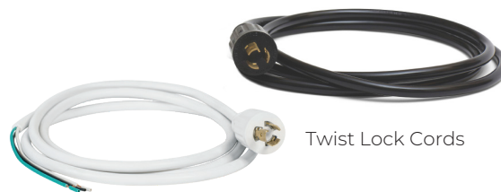
Twist Lock Cords

Built to the NEMA Standard, this locking power cord plug is rated for 120V or 277V circuits, has a fully molded low profile ergonomic shape, and is RoHS compliant. The plug body is molded with deeply contoured ridges and a non-slip grip that makes “plug-in” quick and easy.