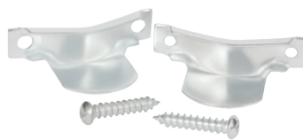
Strain Relief Clamp