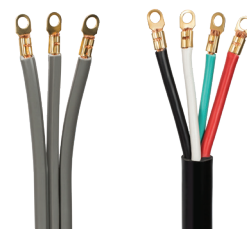
Heavy-Duty Ring Terminals