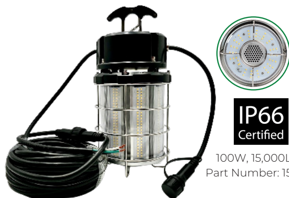
100W, 15,000LM Part Number: 15748