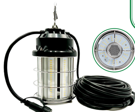
100W, 15,000LM Part Number: 15738