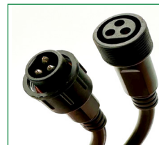
Female and Male Connectors