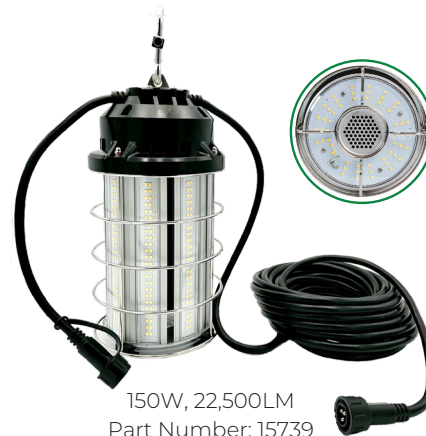
150W, 22,500LM Part Number: 15739