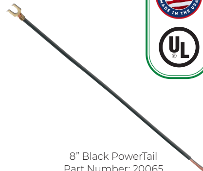
8" Black PowerTail Part Number: 20065