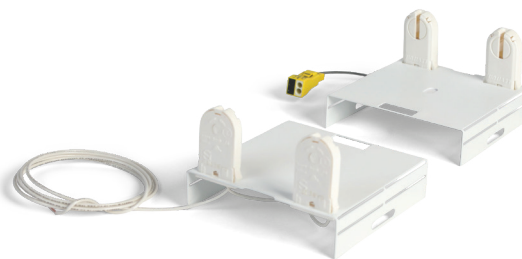
4 foot T8 LED Lamp Retrofit Kit