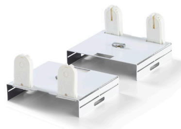
4 foot T8 Retrofit Kit