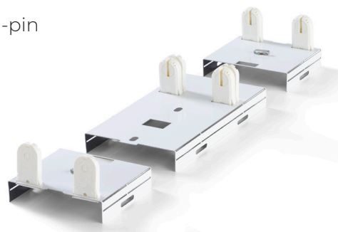
8 foot T8 Retrofit Kit