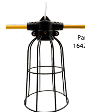
Part Numbers: 16420 and 16425