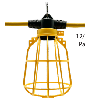
12/3 SJTW Cord Part Number: 16453