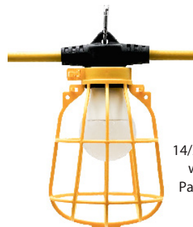
14/2 SJTW Cord with Bulbs Part Number: 16410