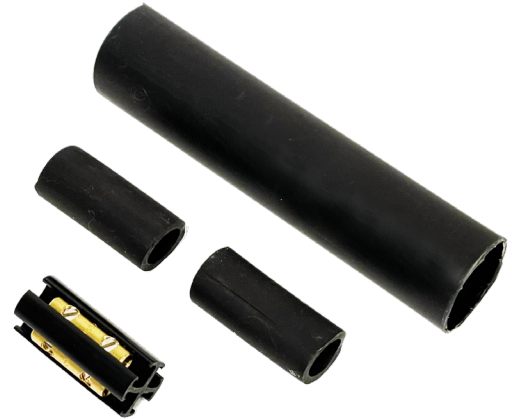
EV Charging Cable Splice Kit Part Number: EVSK-1