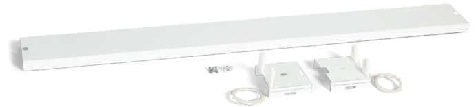
4 Foot Bundled Fixture Bracket Kit