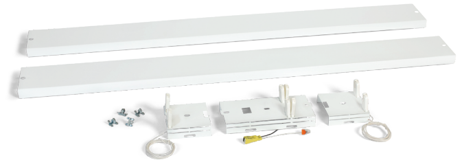
8 Foot Bundled Fixture Bracket Kit