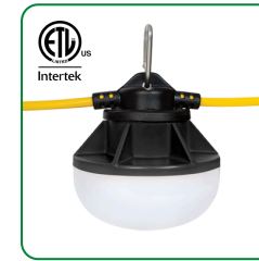
High Lumen LED CordLight 20,000 Lumens P/N 16050