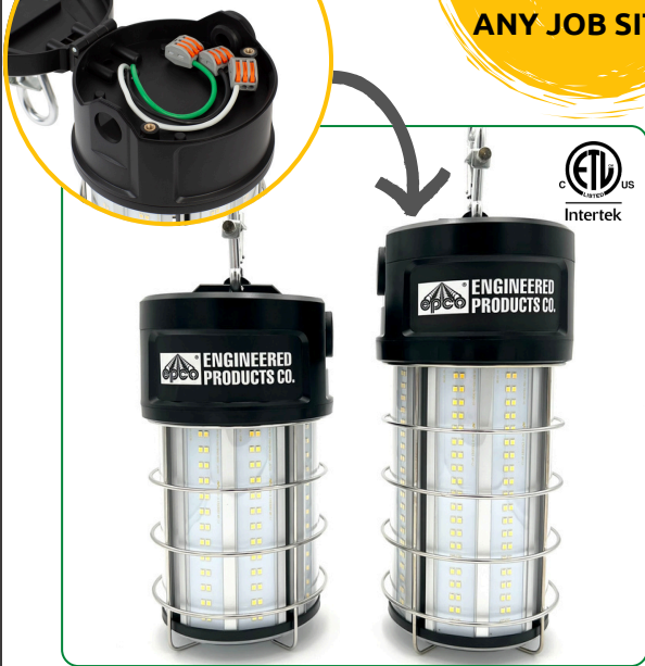
TIGRESS Prefab 100-watt 15,000 Lumens P/N 15742