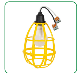
Single Lamp Light Kit P/N 16024 (no lamp) & 16025 (with lamp)