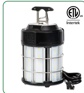
TIGERcub 100-watt 13,000 Lumens P/N 15722