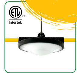
LED CordLights 16,000 Lumens 18/2 - P/Ns 16140 & 16145 18/3 - P/N 16143