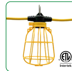
Caged CordLights 14/2 - P/N 16400 & 16410 14/3 - P/N 16454 or 12/3 - P/N 16453