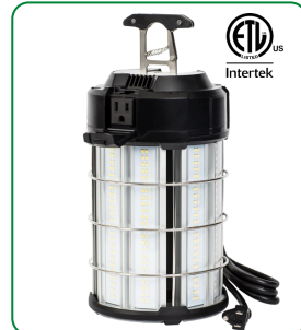
TIGERcub 150-watt 22,500 Lumens P/N 15723