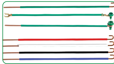
Grounding PigTails and PowerTails