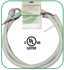
Air Conditioner Whips P/N ACWNM1063-1RA