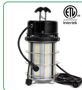
TIGER XL 100-watt Dual Rated 120-277V 15,000 Lumens P/N 15738