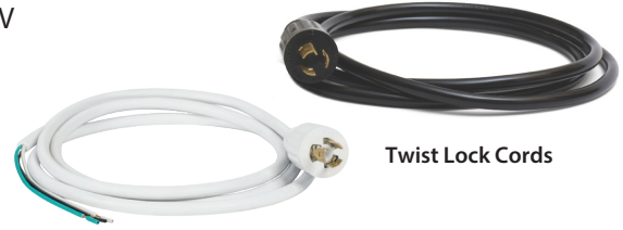
Twist Lock Cords

Built to the NEMA Standard, this locking power cord plug is rated for 120V or 277V circuits, has a fully molded low profile ergonomic shape, and is RoHS compliant. The plug body is molded with deeply contoured ridges and a non-slip grip that makes "plug-in" quick and easy.