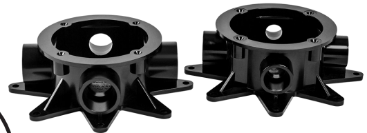
SPIDERBOX™ with Glue-in Hubs (3/4" Hubs) P/N 15248- Left SPIDERBOX™ with Glue-in Hubs (1/2" Hubs) P/N 15245- Right