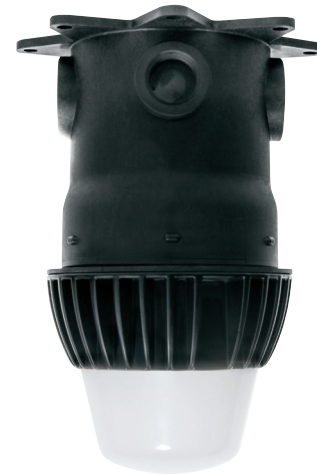
ProSeries LED Utility Luminaire (P/N: 15913)