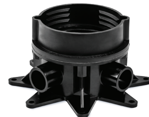
SPIDERBOX™ with Glue-in Hubs and Adapter (3/4" Hubs) (P/N: 15248-ADAPTER)