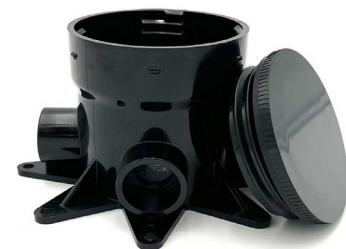
Part Numbers: Octi-Junction Box- 15258 Octi-Junction Box Cover - 15906