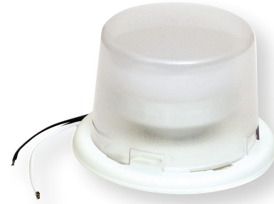
Keyless (P/N: 16531)