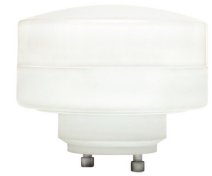
Bi-Pin LED Lamp (P/N: 15676)