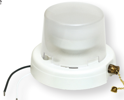
Pull Chain (P/N: 16536)