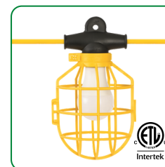
Economy CordLight P/N 16400 & 16410