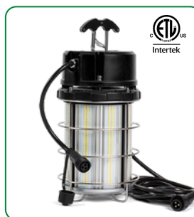
TIGER XL 100-watt Dual Rated 120-277V 15,000 Lumens P/N 15738