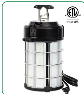
TIGERcub 150-watt 22,500 Lumens P/N 15723