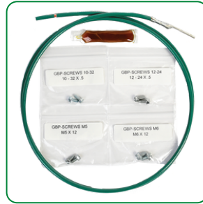
Ground Bonding Jumper Kit P/N EGBP-06-72-00-S