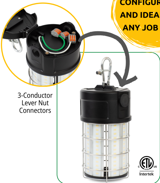
3-Conductor Lever Nut Connectors

INFINITELY CONFIGURABLE AND IDEAL FOR ANY JOB SITE!