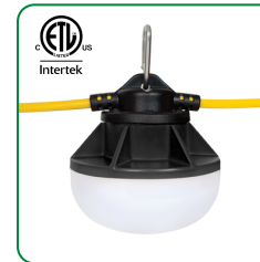
High Lumen Output LED CordLight 20,000 Lumens P/N 16050