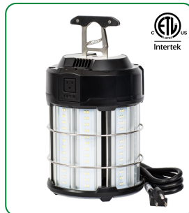
TIGERcub 100-watt 13,000 Lumens P/N 15722