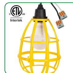
Single Lamp Light Kit P/N 16024 & 16025