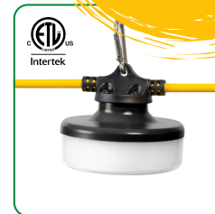
LED CordLights 15,000 Lumens P/Ns 16140 & 16145