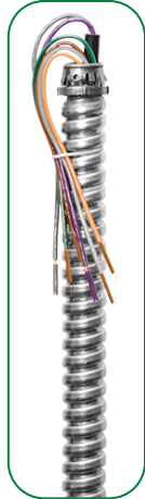
Illumination Control Fixture Whips