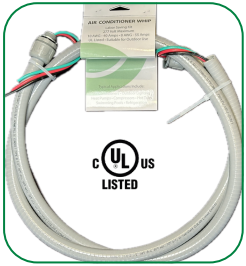
Air Conditioner Whips P/N ACWNM1063-1RA