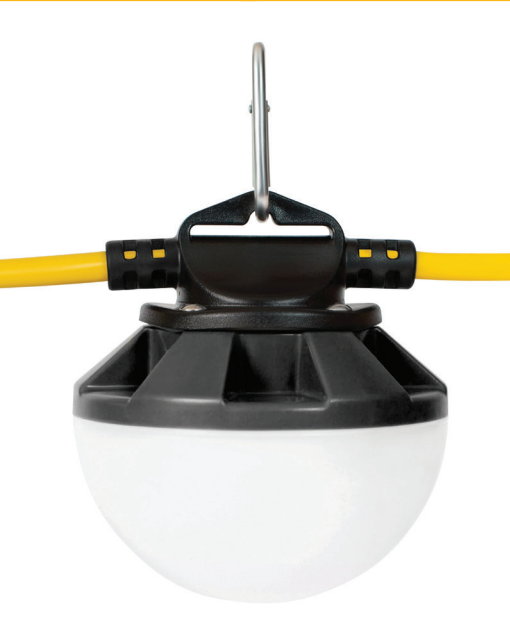
General Purpose LED CordLights Part Number: 16056