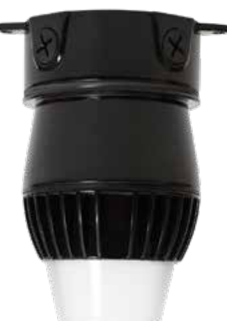
ProsSeries Elite Ceiling/Pendant Mount