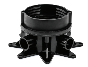
SPIDERBOX™ with Glue-in Hubs and Adapter (3/4" Hubs) (P/N: 15248-ADAPTER)