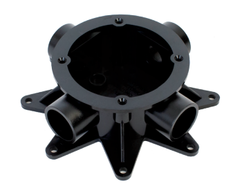
SPIDERBOX™ with Glue-in Hubs (3/4" Hubs) (P/N: 15248)