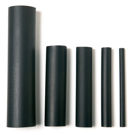
Heat Shrink Tubing