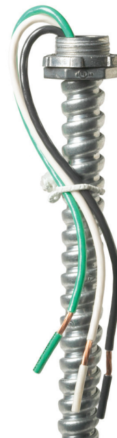
Standard Health Care Fixture Whip Shown with Standard Screw-In Lock Nut Connector