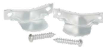
Strain Relief Clamp