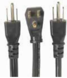
Power/Appliance Replacement Cords

Meets the requirements of the 2023 National Electrical Code: Articles 422.16(A)(1) and (2).