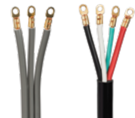
Heavy-Duty Ring Terminals