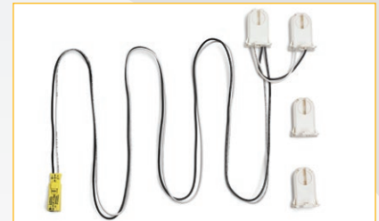
STRIP-LIGHT WIRING HARNESS KIT

Upgrade your lighting system to LED technology at the lowest possible cost by installing EPCO's Strip-Type Wiring Harness Retrofit Kits. These easy-to-install Wiring Harness kits provide you with an energy efficient upgrade from traditional T8 or T12 fluorescent lamps to T8 LED Lamps. This lowers your energy consumption up to 40%, provides long-term sustainable energy savings, complies with local and national energy regulations, and qualifies for rebates from your electric utility.