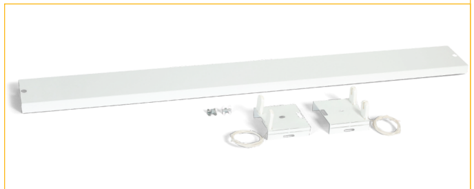
4 Foot Bundled Fixture Bracket Kit