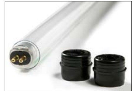
T5 Tube Guard with End Caps

The new T5 Tube Guard, which fits all four-foot T5 lamps, rounds-out EPCO's T8 and T12 family of Tube Guards and is available for immediate shipment. They are sold only in 24-unit case cartons.