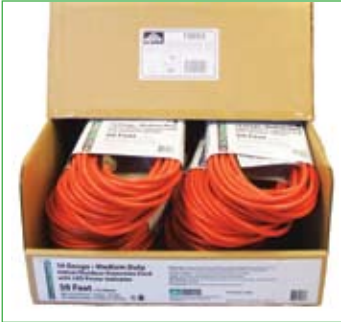
Master carton quickly and easily converts into POS display for convenient counter and shelf merchandising.

EPCO has launched the first of many new products planned for introduction this year. Available for immediate shipping, the medium- and heavy-duty Extension Cords expand the company's line of Residential Product Accessories, and complement EPCO's other cord products, which include: