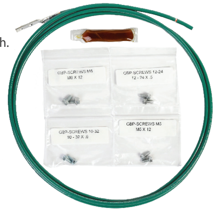
6 AWG, 120" Jumper Kit