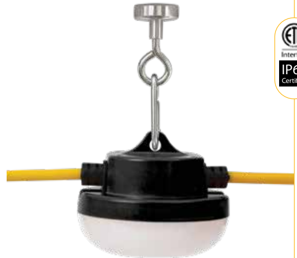
LED CordLights (Standard Lumen Output) Shown with Magnetic Suspension Hanger Part Numbers: 16040 and 16045; Magnetic Suspension Hanger: CORDLIGHT-MH