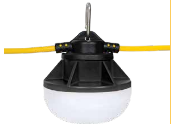
LED CordLights (High Lumen Output) Part Number: 16050